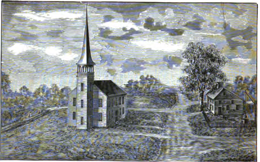
THE SECOND EDIFICE.